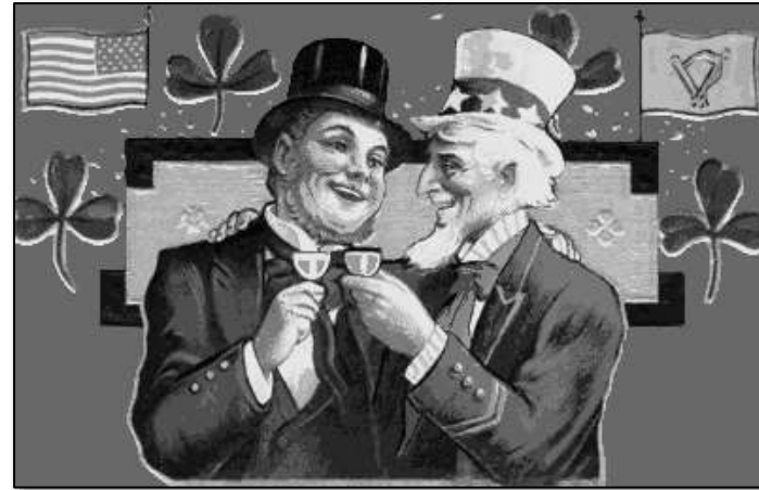
Although originally an Irish holiday, St. Patrick's Day is celebrated in the U.S. with enthusiasm! But how did it begin?

Corn beef and cabbage: Financially depressed upon immigration, many Irish could scarcely afford a celebratory meal. For most, beef and cabbage was a luxury. That's how it became and remains a staple for the holiday.